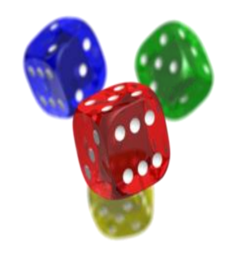
Fig 4: A PNG image with 8-bit transparency channel