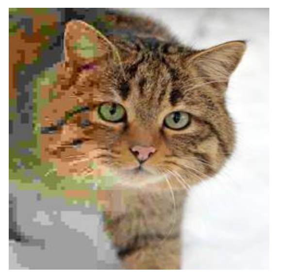
Fig. 3: A photo of a cat with the compression rate decreasing, and hence quality increasing, from left to right.