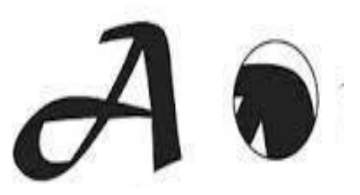
Fig.6: Vector Graphics

If you zoom in on the paths (or lines) of vector graphics the line or curve you zoom in on will always be sharp, in focus, and have smooth edges, this is because the line is reproduced by the same mathematical formula each time you zoom in, and so you do not get any blockiness associated with raster graphics as pixels are not used by vector graphics [6].