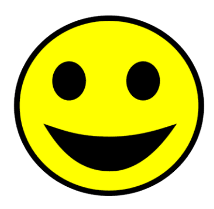
Fig 2: A focussed and crisp GIF image